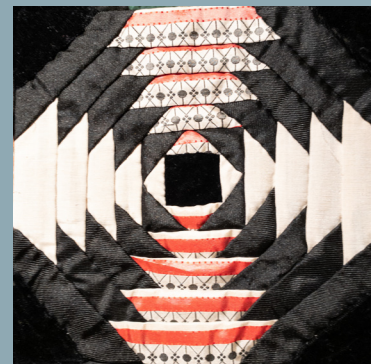
19th century quilts

This logo symbolizes the Ripon Historical Society's steadfast commitment to preserving history, sharing stories, and our continuing adaptability so that we can best serve today's Ripon community.