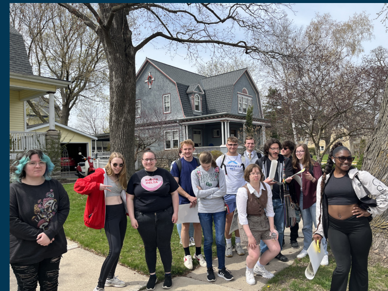
Ripon College students enjoying a walking tour of historic houses.